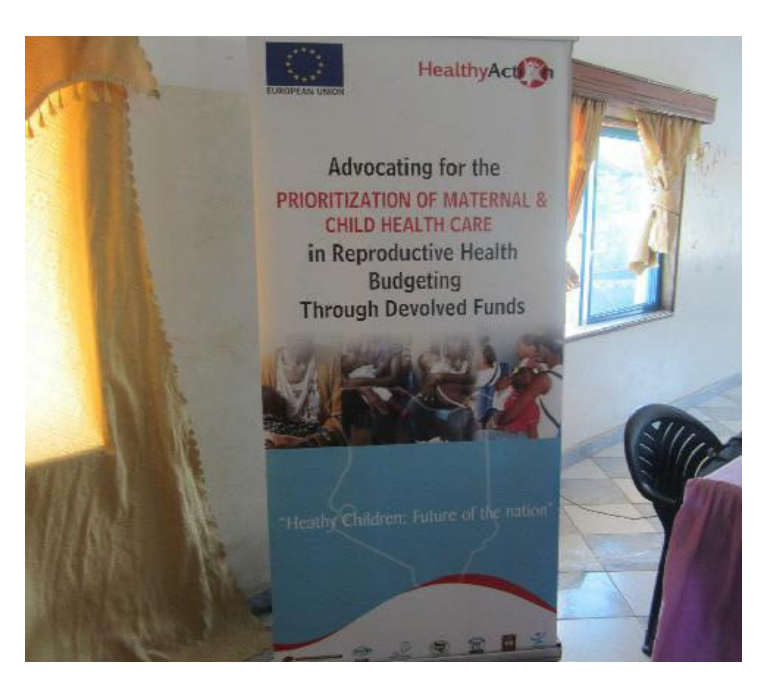
The project's roll up banner.